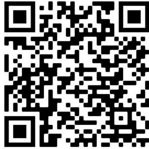
BDJH Counseling Website