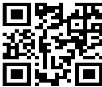
Counselor Recommendation Request