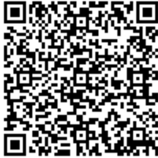
Houston Area HAN Alert