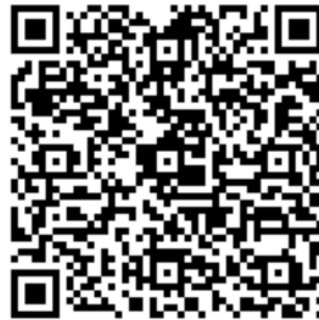
CDC HAN Alert