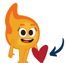
Heart is caring