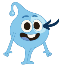
Eyes are watching